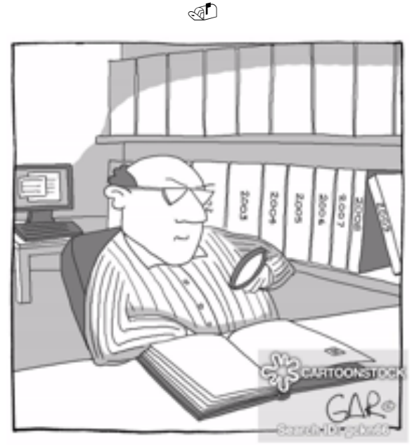
"20 years as Stamp Club Chairman and they send my retirement card by E-MAIL"

SEAPEX had some of the best exhibits I've enjoyed in years. Thank you, exhibitors and show committee.